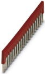
Plug-in bridge, Length: 23 mm, Width: 122.3 mm, Number of positions: 20, Color: red

Please be informed that the data shown in this PDF Document is generated from our Online Catalog. Please find the complete data in the user's documentation. Our General Terms of Use for Downloads are valid ( http://phoenixcontact.com/download )