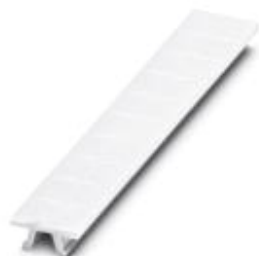
Zack marker strip, 10-section, horizontally labeled with the consecutive numbers: 11 ... 20, white, Width: 6 mm

Please be informed that the data shown in this PDF Document is generated from our Online Catalog. Please find the complete data in the user's documentation. Our General Terms of Use for Downloads are valid ( http://phoenixcontact.com/download )