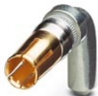
POWER contact, for D-SUB combination inserts, for PCB assembly, socket, angled, rated current 40 A, gold-plated

Please be informed that the data shown in this PDF Document is generated from our Online Catalog. Please find the complete data in the user's documentation. Our General Terms of Use for Downloads are valid ( http://phoenixcontact.com/download )