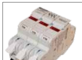
WMB Marker System