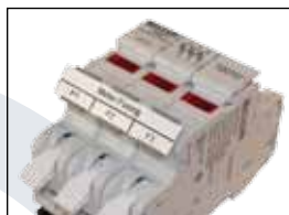
Continuous marking strip and adaptors

* USCMA required for use with USCM0 and USCM1