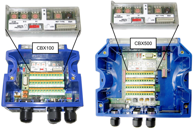
Figure 2 – BM100 Mounting