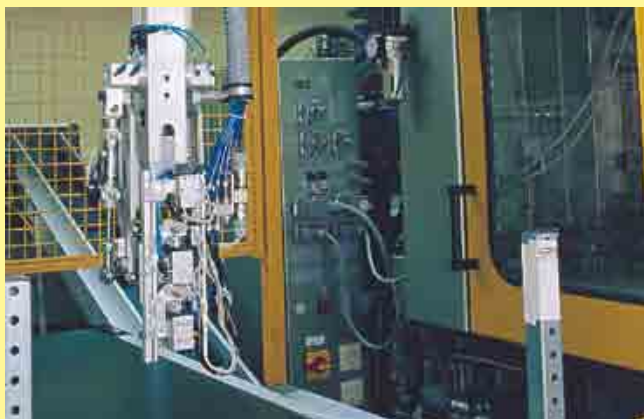
Connector at an injection moulding machine